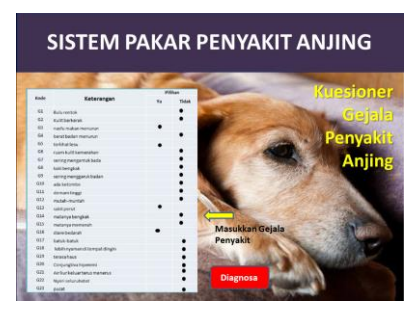
Display questionnaires for symptoms of canine disease